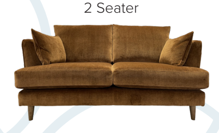
W-169 cm H-88cm D-100 cm