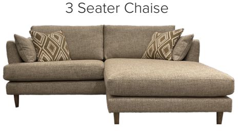
W- 221 cm H- 88cm D- 163 cm