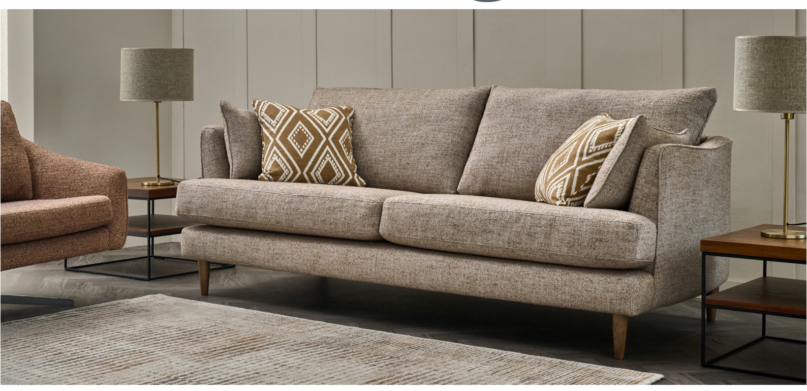
Image shows a 3 Seater in Bemaze Nature with Toulin Copper Scatters and Wooden Legs in Smoke Finish.